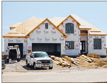
King's Court Builders will be one of the participants in the Cavalcade of Homes this year.

"In the past 18 months things have been improving at a rapid pace locally," Eckstein says. "The construction activity this year is amazing to see. Just look at the rooftops going up around town. The National Association of Home Builders had predicted a return to "normal" starting in mid 2013. I would say they nailed it for our market. The 2014 market is looking like it will be a very strong year for new homes in Naperville and surrounding communities."